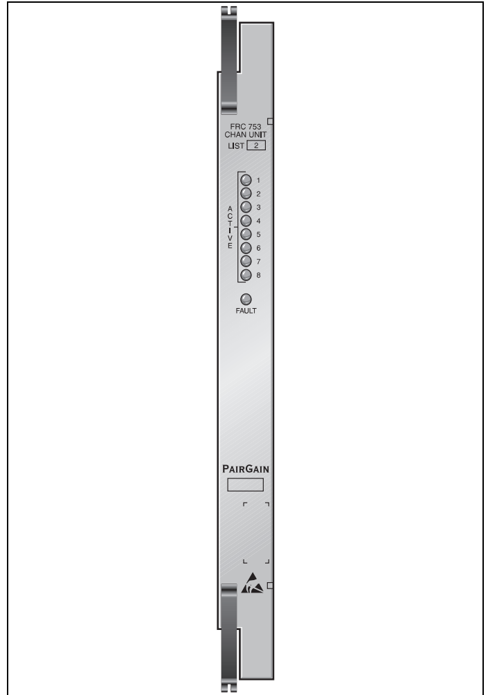
Figure 1. FRC-753 COT Channel Unit Front Panel. The PairGain FRC-753 provides eight POTS interfaces between a PG-Flex Remote Terminal and the subscriber.

CAUTION This product incorporates static sensitive components. Proper electrostatic discharge procedures must be followed.